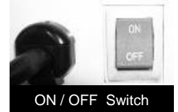
ON / OFF Switch