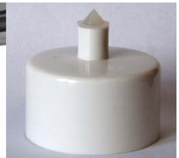
Float with rubber stopper