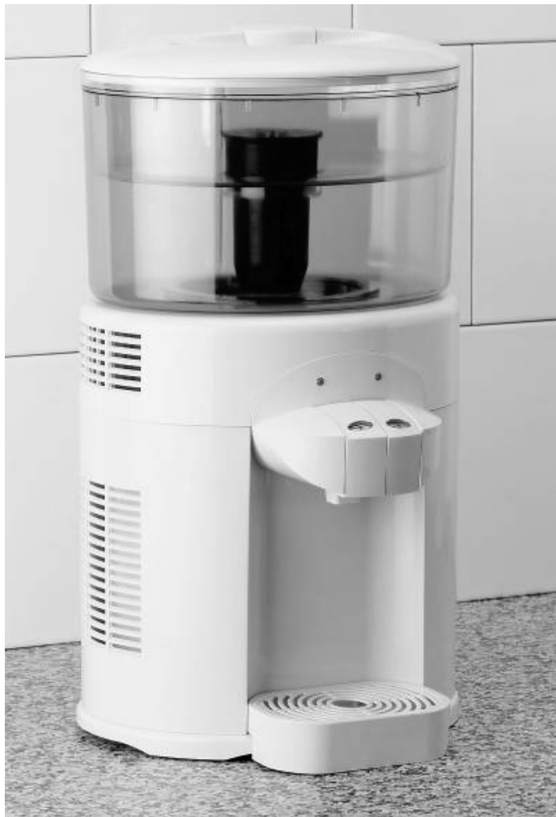
Table Top Water Filter with Chiller