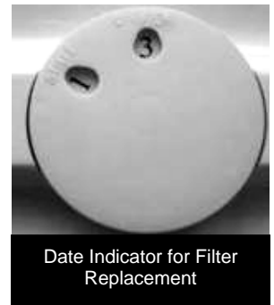
Date Indicator for Filter Replacement